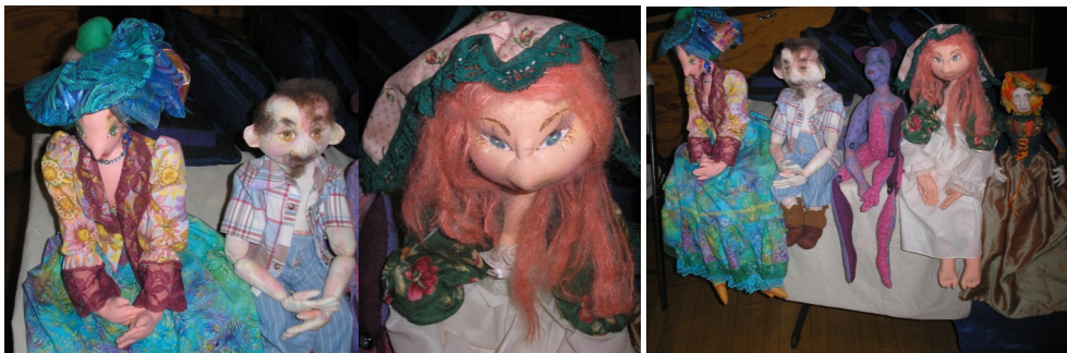
Some of Louise Beckman's cloth art; some very entertaining dolls.